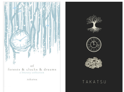
Special Edition Covers